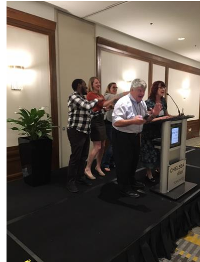
Promotion of next year's conference.