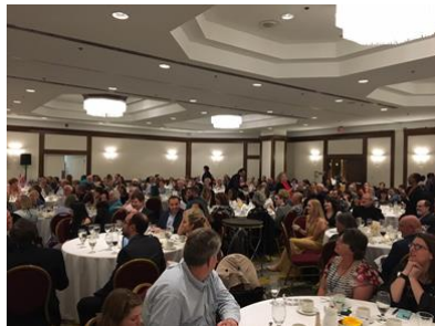
Folks Enjoying the Evening